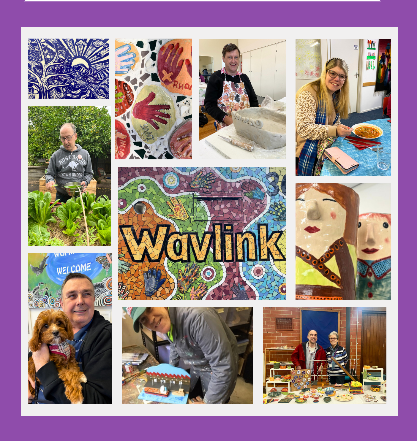
Wavlink Activity Guide Semester 1 2024